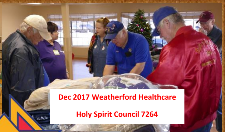
Dec 2017 Weatherford Healthcare Holy Spirit Council 7264