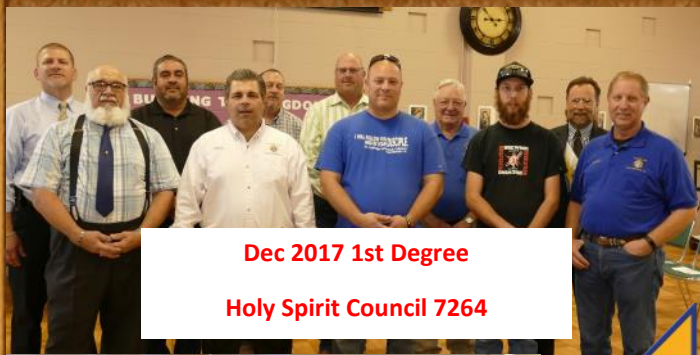
Dec 2017 1st Degree Holy Spirit Council 7264