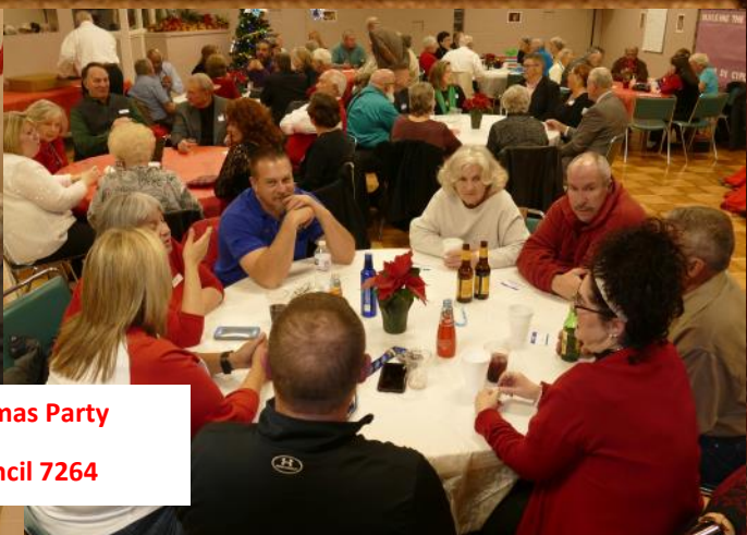
Dec 2017 Christmas Party Holy Spirit Council 7264